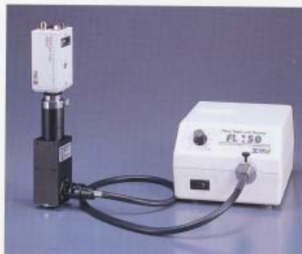
VM-1V with CK3900, FL150 and FL150/95