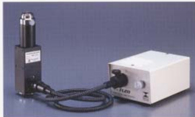
VM-1V with FL20, FL20/05 and FL20/15