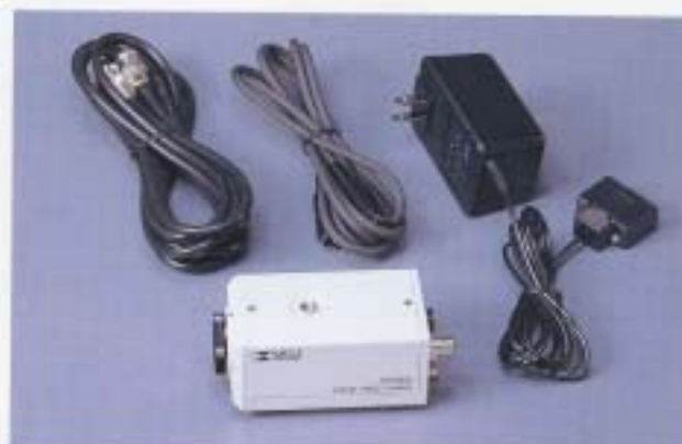
CK3900, AC Adapter and Cables