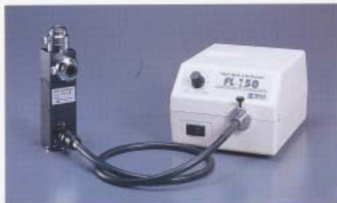
VM-1D with FL150 and FL150/95